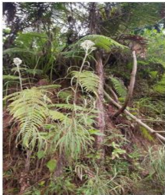
C. Anaphalis sp.