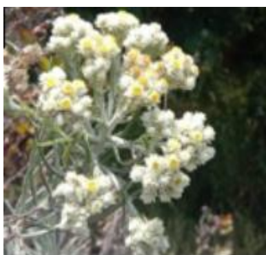
Figure 2. Anaphalis Javanica (Kuswanto et al., 2021).

The Javanese edelweiss (Figure 2) is a hardy pioneer plant that has begun to colonize burned-out slopes. Javanese edelweiss can grow in open and hot environments such as craters and peaks, but it cannot compete for growth in dark and humid forests. Javanese edelweiss is a pioneer vegetation that lives in volcanic areas and can survive in barren soils. Javanese edelweiss is not tolerant and can survive in nutrient-poor soils because it can effectively form mycorrhizae with certain soil fungi. This is a flowering plant of the Asteraceae family that grows in the mountains. This type, like other Anaphalis characteristics, has flowers that are durable and not easily damaged. A tight arrangement of flowers creates a lot of compound interest. Brownish white flowers adorn the flower crown.